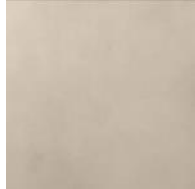
PT-24-BISON BOOST BAL ASH