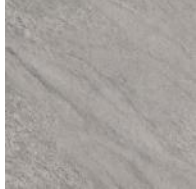
PT-24-BISON BRAVE PEARL* PT-48-BISON BRAVE PEARL*