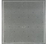
PT-TRAY-2424 PAVER TRAY