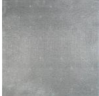
PT-BACKER-2424 PAVER BACKER