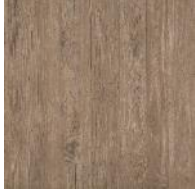
PT-24-BISON AXI BROWN CHESTNUT