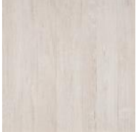
PT-24-BISON AXI WHITE PINE