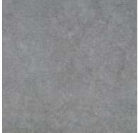
PT-24-BISON SEASTONE GRAY