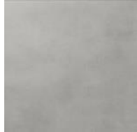
PT-24-BISON BOOST BAL GREY