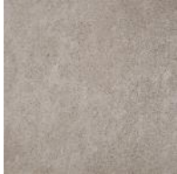
PT-24-BISON TRUST SILVER