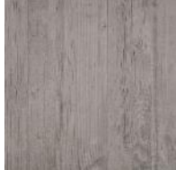
PT-24-BISON AXI GREY TIMBER