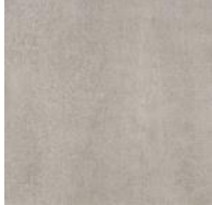
PT-24-BISON MARK CHROME PT-48-BISON MARK CHROME*