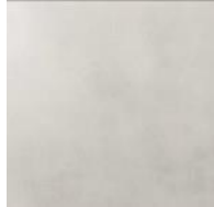
PT-24-BISON BOOST BAL PEARL