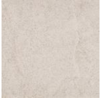
PT-24-BISON BLOCK BIANCO