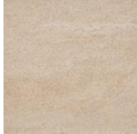
PT-24-BISON TRUST GOLD*