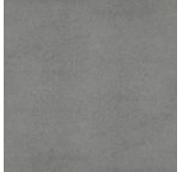
PT-24-BISON BLUESTONE PT-48-BISON BLUESTONE*